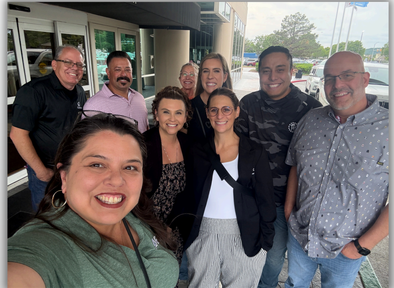
APWA Region VII Meeting-Tulsa, OK